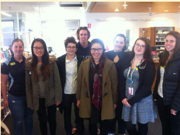
Imparting wisdom at the Rural High School Visit in Ballarat