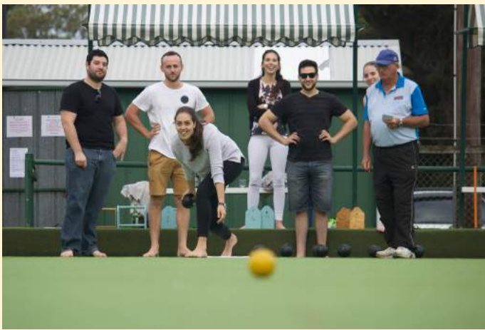
Bowling over the competition at Lawn Bowls