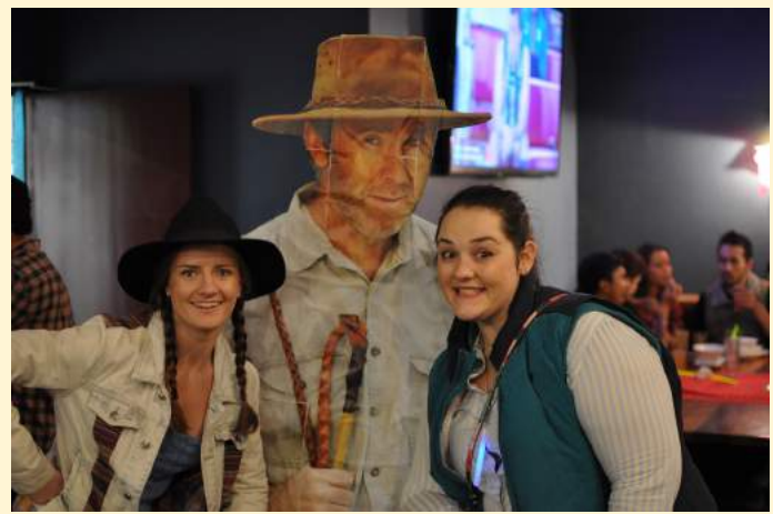
The legendary Russell Coight with students at the Country Fair