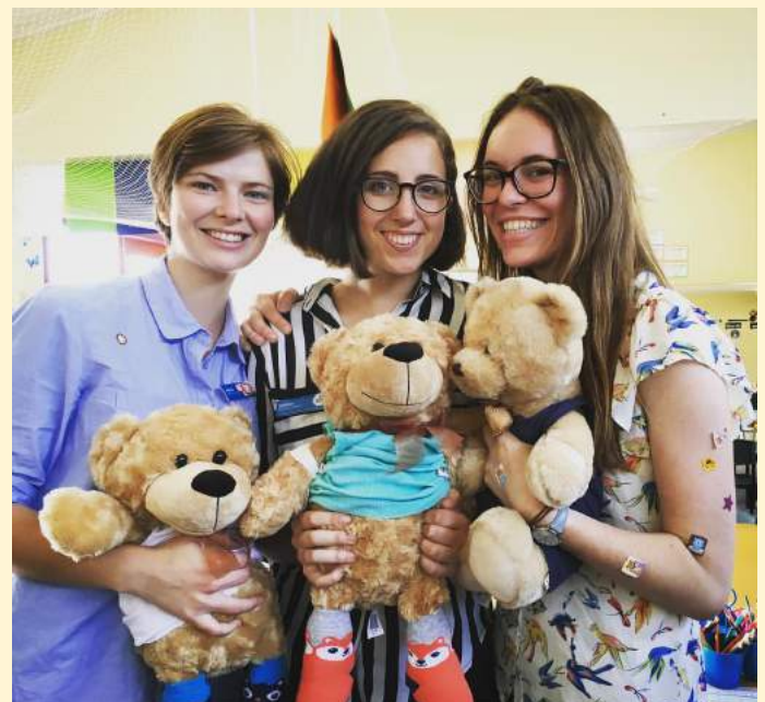
Saving furry lives at the Teddy Bear Hospital