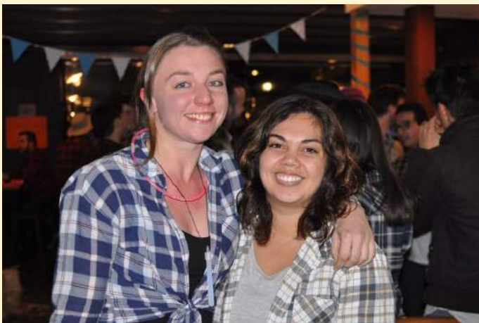
Students enjoying the Country Fair